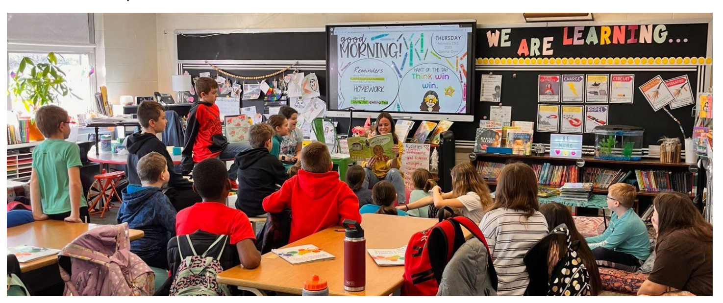
...into Miss Darnall's class reading a book together!